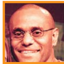
Associate Diploma of Ministry Studies