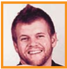
Associate Diploma of Ministry Studies

I’m now the senior pastor of Goodlife Church in Newcastle and continue to apply the lessons learnt at CMC through everyday life and ministry. I recommend CMC to anyone serious about their life in God, their ministry in the market place, in the church or the community ”