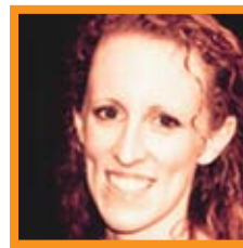
Diploma of Ministry Studies

Overseas students (Non-Australian residents): Please contact Citipointe Ministry College citipointechurch.com/cmc or Christian Heritage College www.chc.edu.au for information on admission procedures.